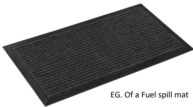
EG. Of a Fuel spill mat

ALL RIDERS MUST HAVE A MIN 1KG FIRE EXTINGUISHER AVAILABLE TO THEM IN THIER PIT. IF SHARING A PIT TENT WITH ANOTHER RIDER THERE MUST BE AT LEAST 1 FIRE EXTINGUISHER PER TENT.